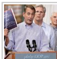
Obama Needs An Enemy