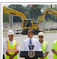
The Biggest Loser Last Night