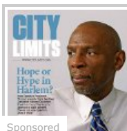
'There Is No Science': Geoffrey Canada's Philosophy City Limits - News